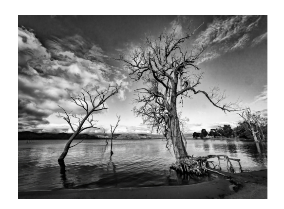
Ludlows serenity Accepted Geoff Bayes