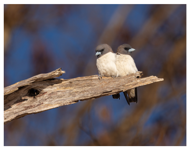
Wood swallows 1 of 1 Merit Kaye Kennedy