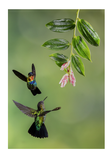
Fiery throated Hummingbirds Merit David Woolcock