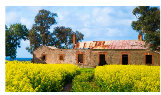
Yellow Road to Ruin Accepted Bernard Clancy