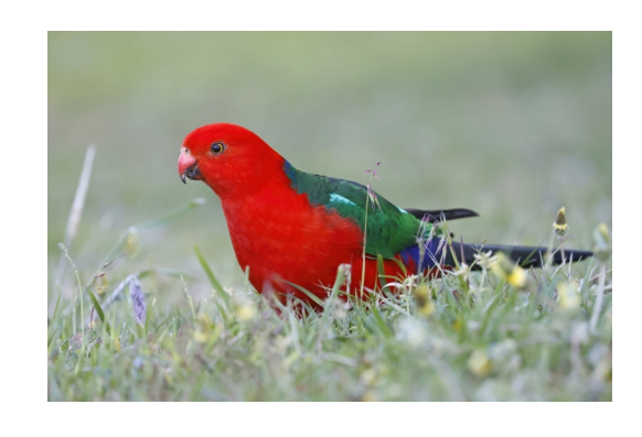
King Parrot - Male Accepted Neville Bartlett