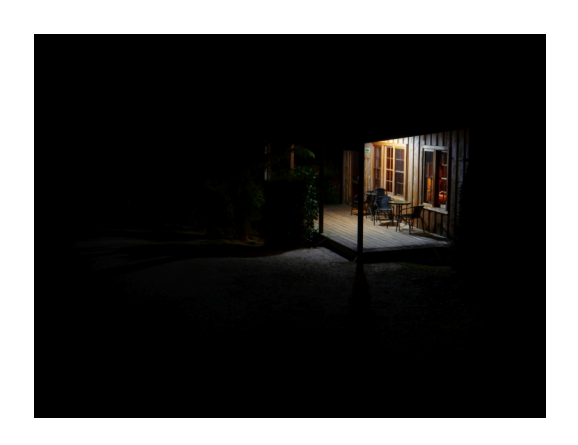
Forest Lodge Accepted Pamela Milliken