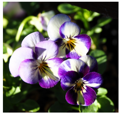
Good Morning Accepted Judy Hofmeyer