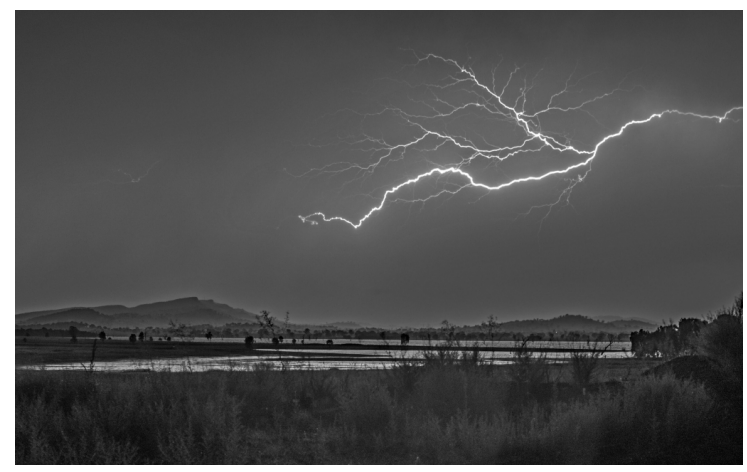
Night into day Merit