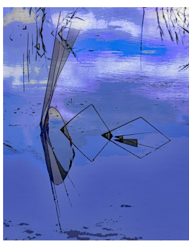
Skywater Dream Accepted Patsy Cleverly