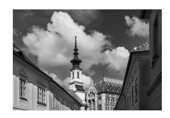
Reaching To The Sky Accepted Wendy Stanford