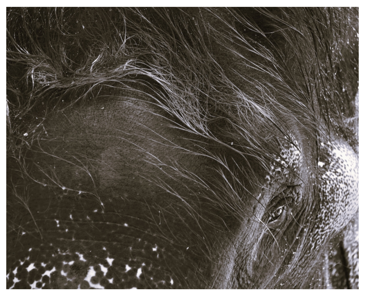
Beauty and the Beast First Place Leanne Wheaton