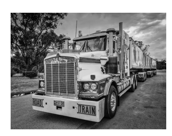
B Triple Accepted Garry Pearce