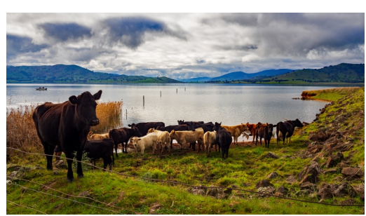
Stranded Accepted Geoff Bayes