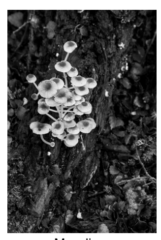
Mycelium Accepted Wendy Slater