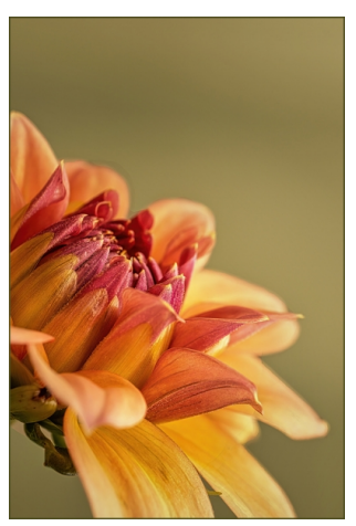
Bathed in the Light Accepted Win van Oosterwijck