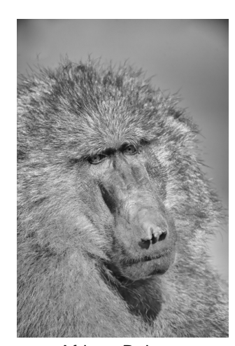
African Baboon Accepted Malcolm Godde