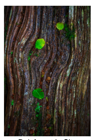
Rainforest In Situ Accepted Wendy Slater