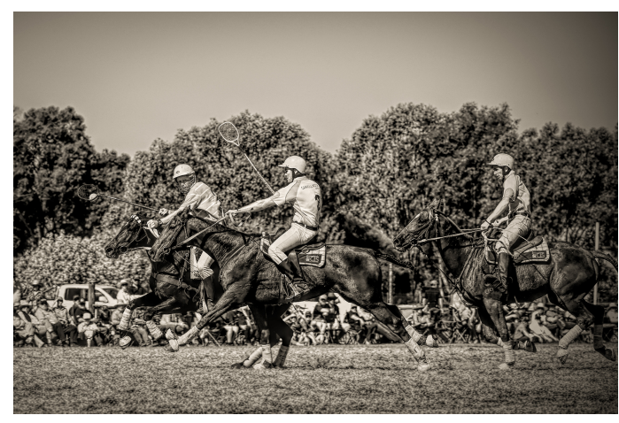
Fast Moves Merit Vicki Cain