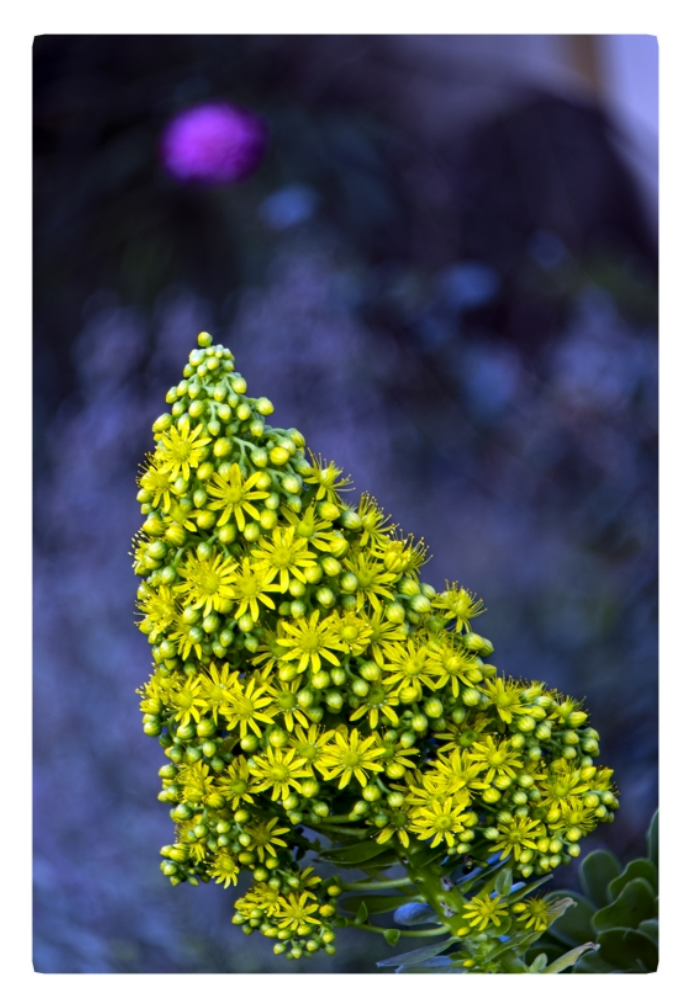
Succulent Flower First Place Glenn Rose