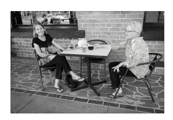
Enjoying Holbrook Accepted Win van Oosterwijck