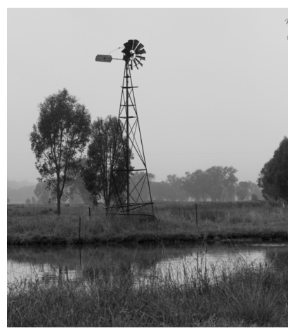
The old windmill Accepted Kaye Kennedy