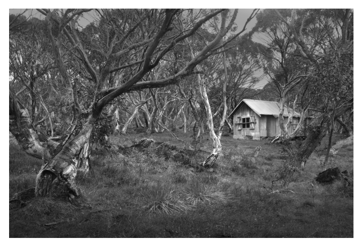
Hut in the trees Merit Jill Hancock