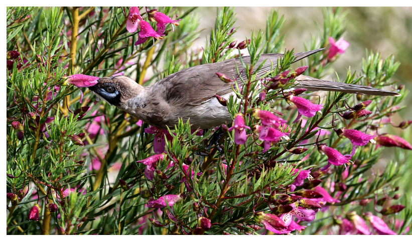
Blue Cheeked Honey Eater Feeding Merit William Cleverly